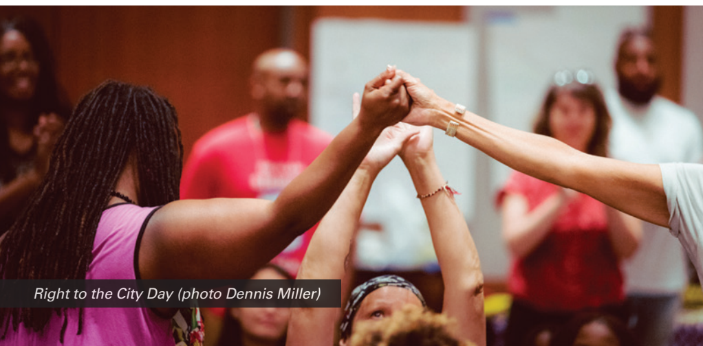
Right to the City Day

We sent staff to Facing Race, presented by Race Forward, where more than 3500 racial justice workers across the country convened in Detroit, MI. Several staff members went to Black 2 Just Transition Assembly in Detroit where The East Michigan Environmental Action Council and the Climate Justice Alliance brought together 60+ organizers. Together, we examined systemic change pathways away from destructive industries and moving towards models that center the health, well-being and self-determination.