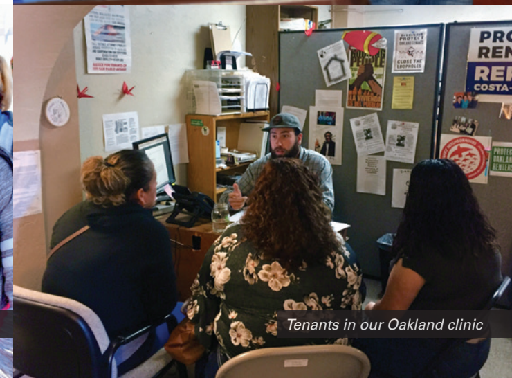
Tenants in our Oakland clinic