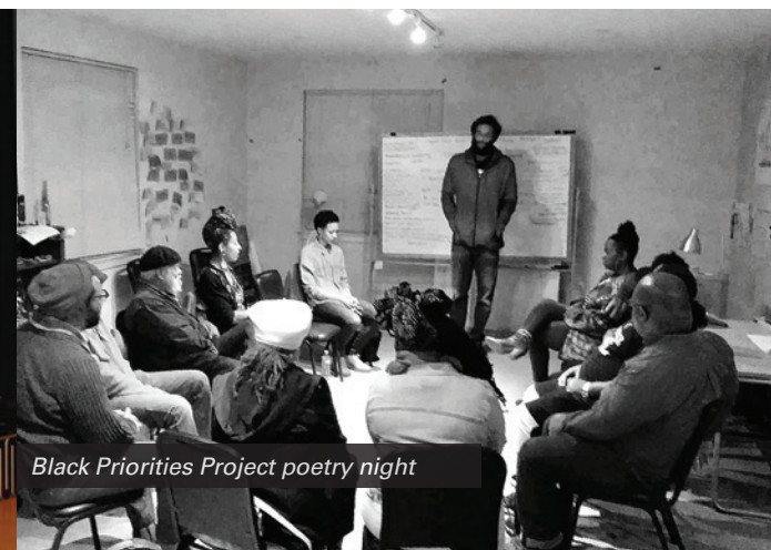
Black Priorities Project poetry night