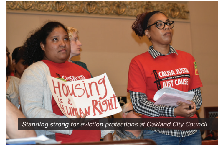
Standing strong for eviction protections at Oakland City Council

triplexes. We also won legislation requiring relocation fees for evicted renters. This ordinance can help an estimated 222,000 people with assistance to move instead of sending our people onto the streets with nothing. In San Francisco, Causa Justa ran a Spanish language outreach team, contributed to the winning of Prop C, a tax on large corporations to support homeless housing and services.